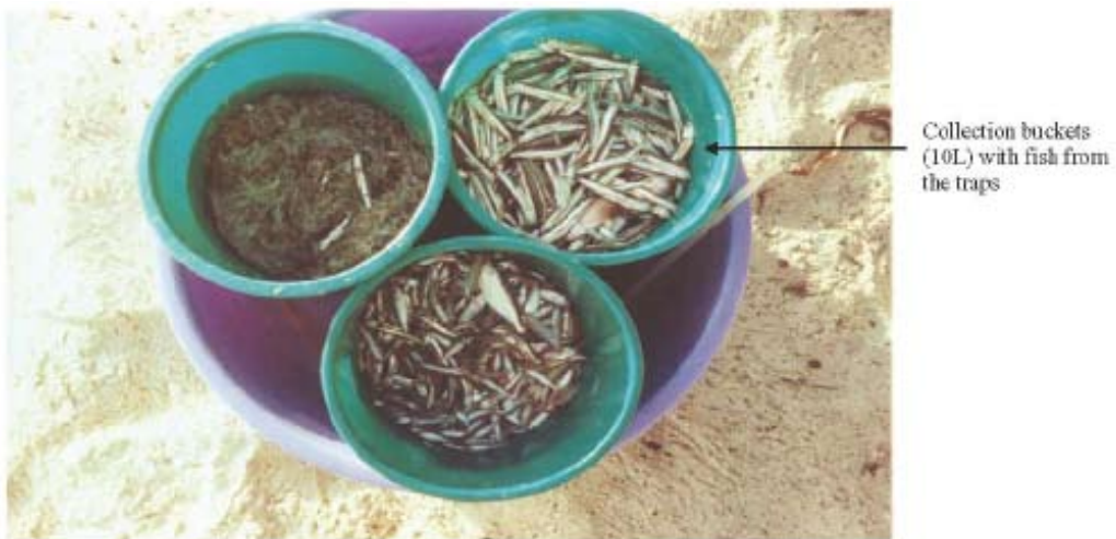
Plate 1 b: These replaced the 1L collecting bottle in order to accommodate larger amounts of fish