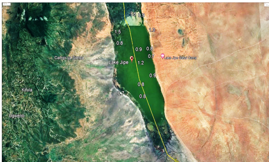
FIGURE 1 Map showing Lake Jipe (Orina, 2022).

This study was carried out at Lake Jipe along Taveta Sub-County, Taita Taveta County, Kenya and in Mwanza District, United Republic of Tanzania (Figure 1). The lake's major water sources are Mt. Kilimanjaro's Lumi River supported by several temporary streams from the Pare Mountains in Tanzania. The lake was divided into 14 sampling points set at equidistant parallel to each other from the south to the North. The wet and dry seasons sampling points covered Northern, Central and Southern parts of the lake. Based on the lakes' shape and to ensure total sampling coverage, it was divided longitudinally into two equal halves with the help of a handheld GPS machine and further horizontally split into 14 quadrants each measuring \approx 1.95 \text{ km}^2 . In addition, the sampling points depths were measured using Solar Transducer and GPS coordinates recorded using GPSMAP® 65 s. Multi-Band GPS Handheld with Sensors was used to inform lake surface area. In situ physical chemical parameters for dissolved oxygen (DO), temperature, pH, conductivity, salinity, oxidation reduction potential (ORP) and turbidity levels were taken using water quality