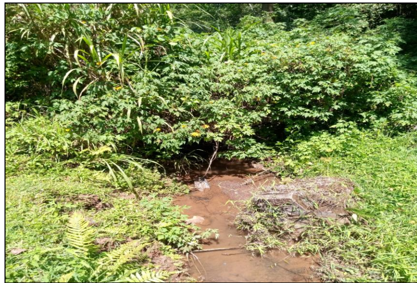
Plate 3: The forested area of omubira stream