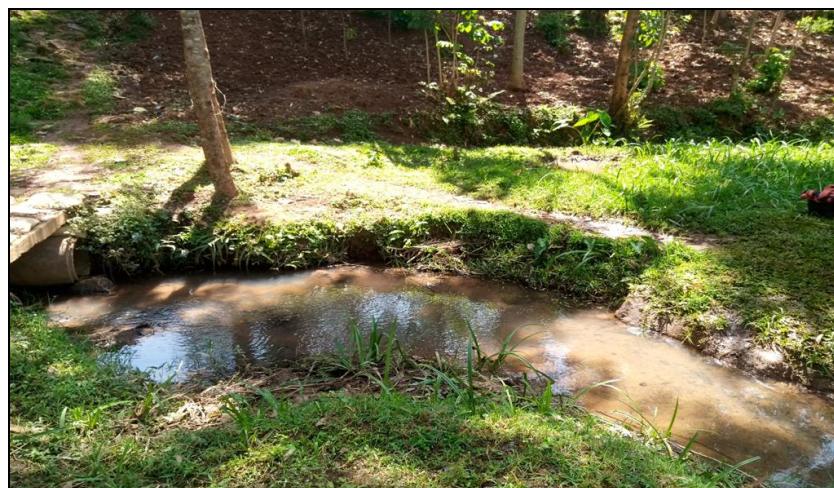
Plate 1: The Town area of Omubira stream

Results in Table 3 show the spatial variation in macroinvertebrates abundance in sampling sites along River Omubira during the study.