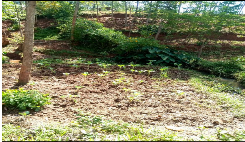
Plate 2: The Agricultural Area of Omubira stream