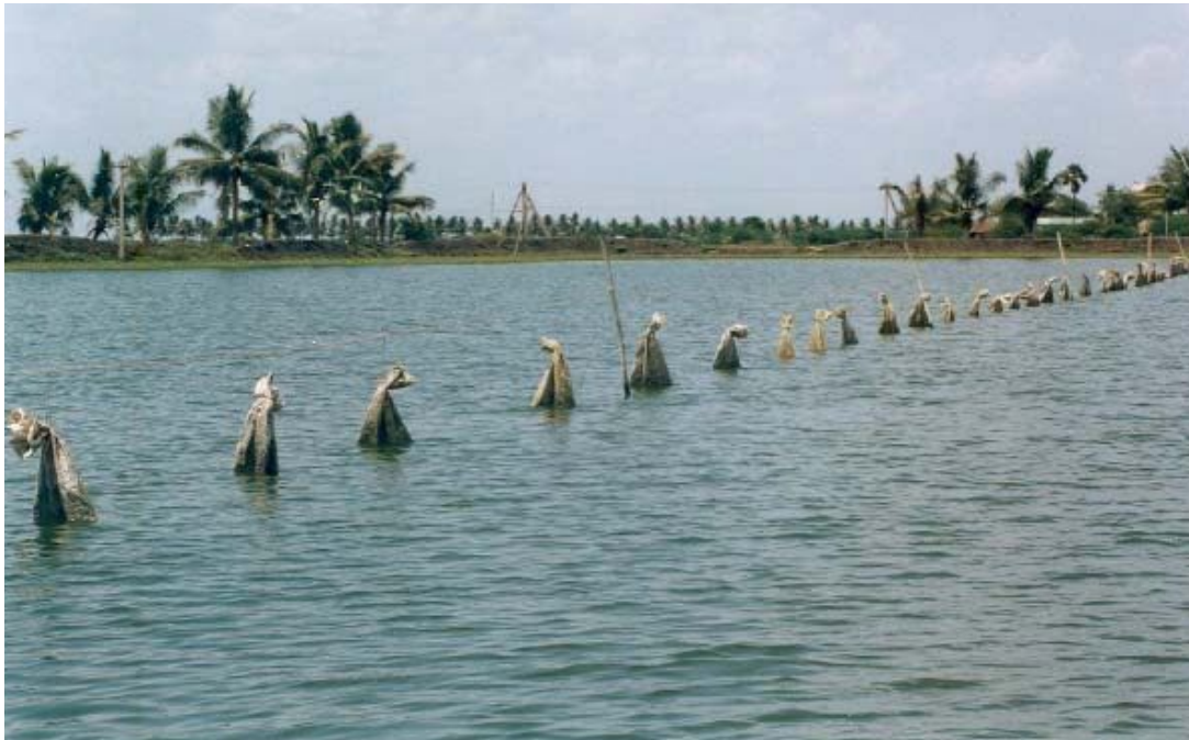
Plate 1: Suspended feeding bags in a fish pond [29]

energized. This strategy advances feeding on demand and results in higher growth rates, improved feed ingestion rates, and higher retention rates [10].